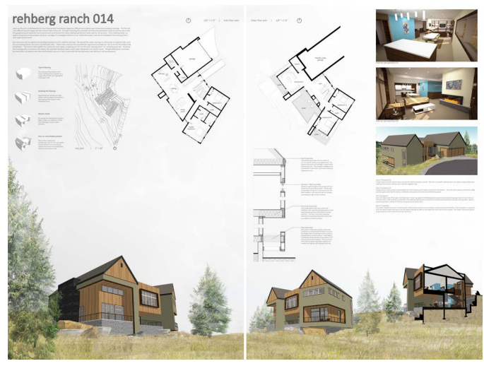
2014 Billings Architectural Association Submission